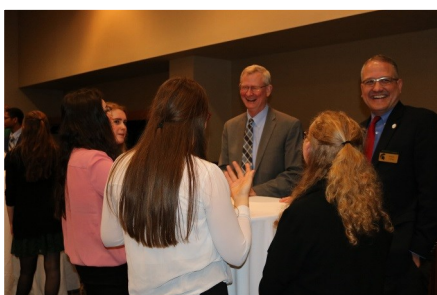
2018 Capitol Experience participants interacting with resource people.

Registration for the 2019 4-H Citizenship Washington Focus (CWF) program, taking place June 22-29, is now available. Program participants learn about the nation's government by participating in hands-on leadership workshops and touring historical sites in Washington, D.C. The cost of the 2019 4-H CWF program is $1,500 and includes all meals (except seven meals in transit), lodging and transportation. Visit https://events.anr.msu.edu/CWF2019/ to register.